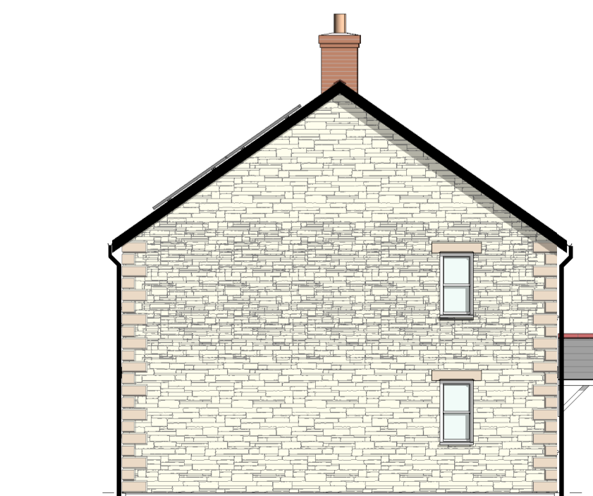
Side Elevation 1 : 100