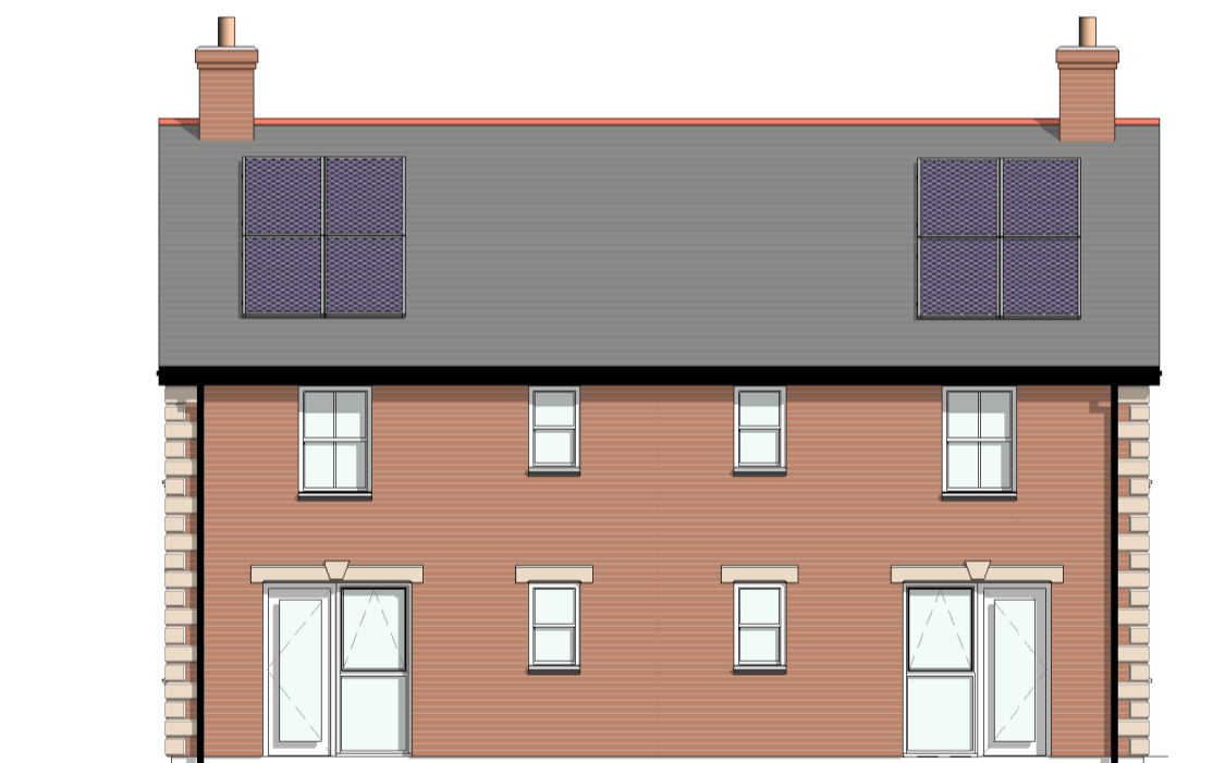
Rear Elevation 1 : 100