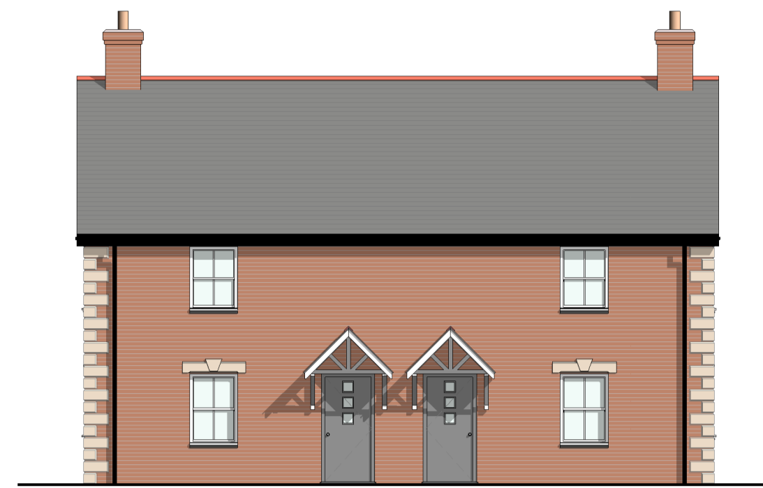
Front Elevation 1 : 100