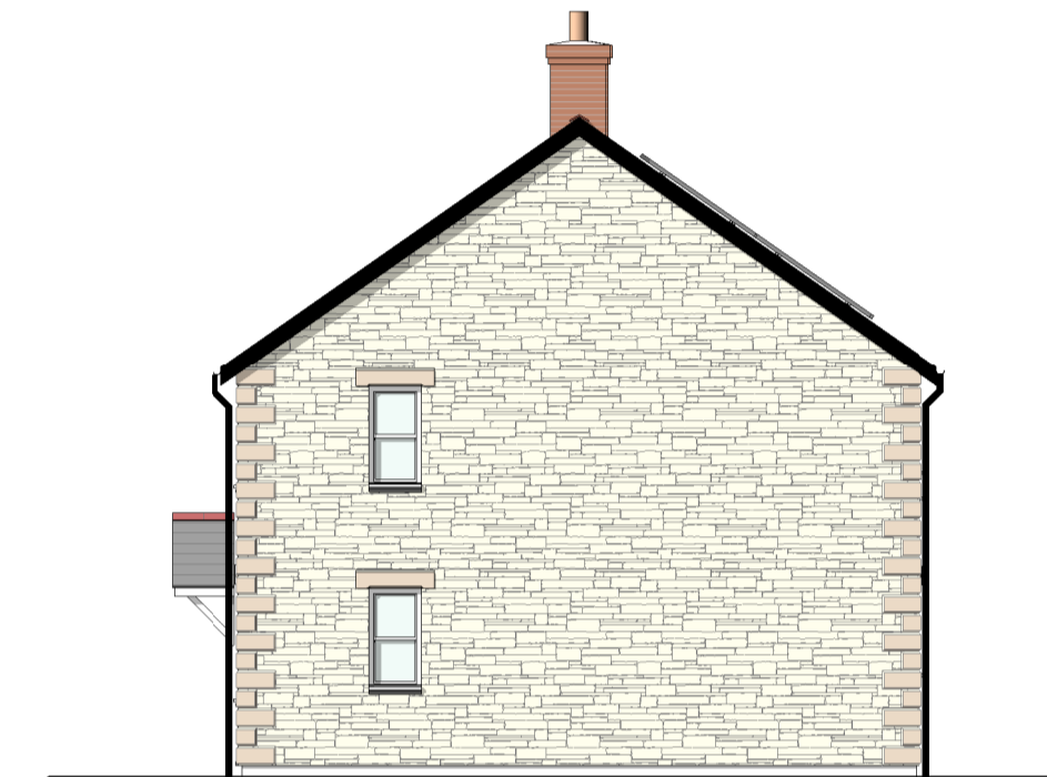
End Elevation 1 : 100