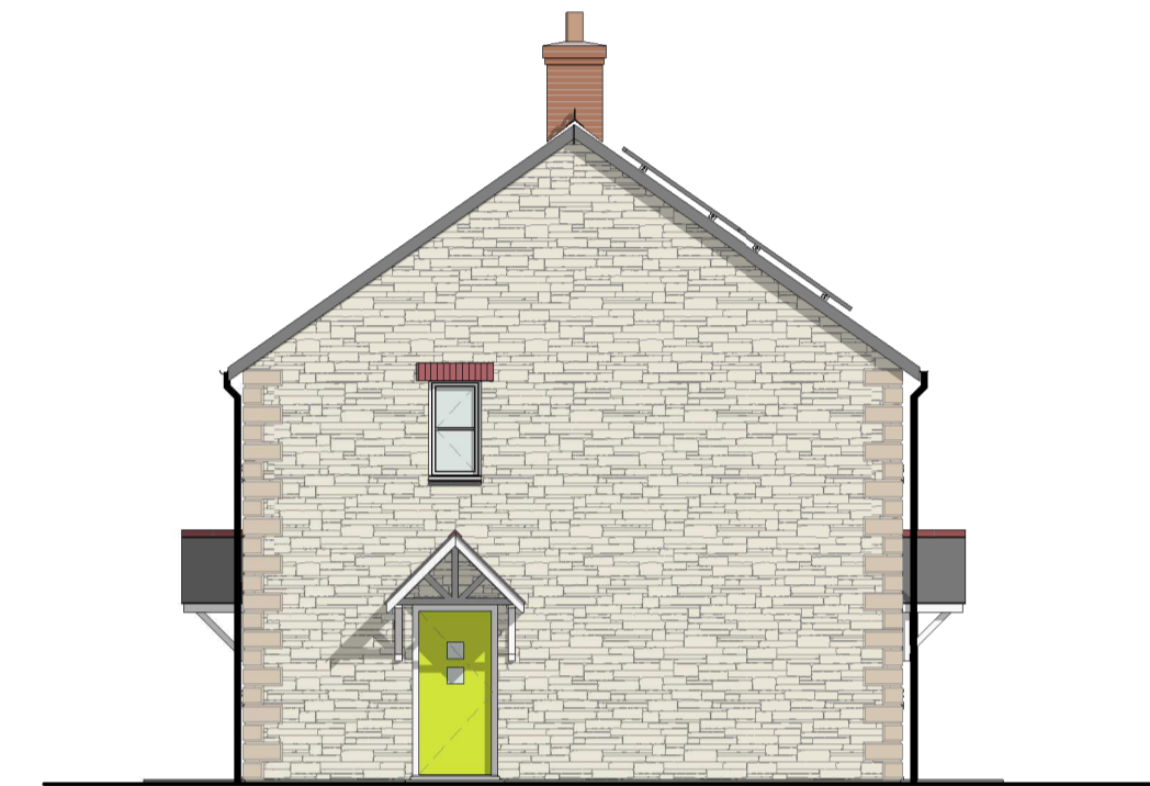
Side Elevation 1 : 100